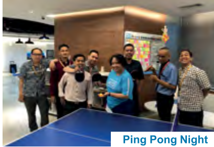
Ping Pong Night

Employee is at the center of what we do. We strive to make work more fun, energized and inclusive.