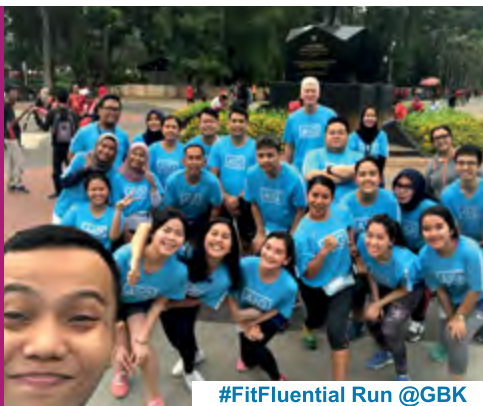
#FitFluential Run @GBK

Every program embraces all segments in promoting Diversity and Inclusion. D&I is in our DNA.