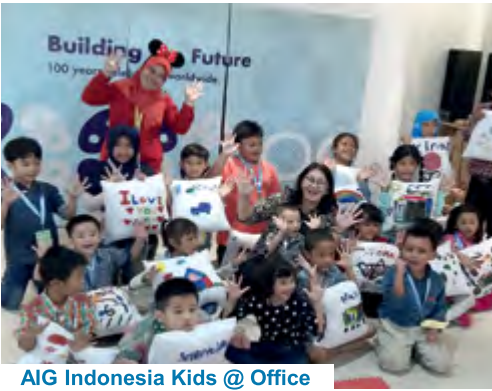
AIG Indonesia Kids @ Office

A group of employees from any background, includes but not limited to gender, age/generation, ethnicity, and religious beliefs which aims to embrace and leverage differences as part of our strength to collaborate effectively. The group is to facilitate and enhance discussions where creativity and innovation are explored, sense of tolerance and respect each other are built in creating a conducive and inclusive work environment.